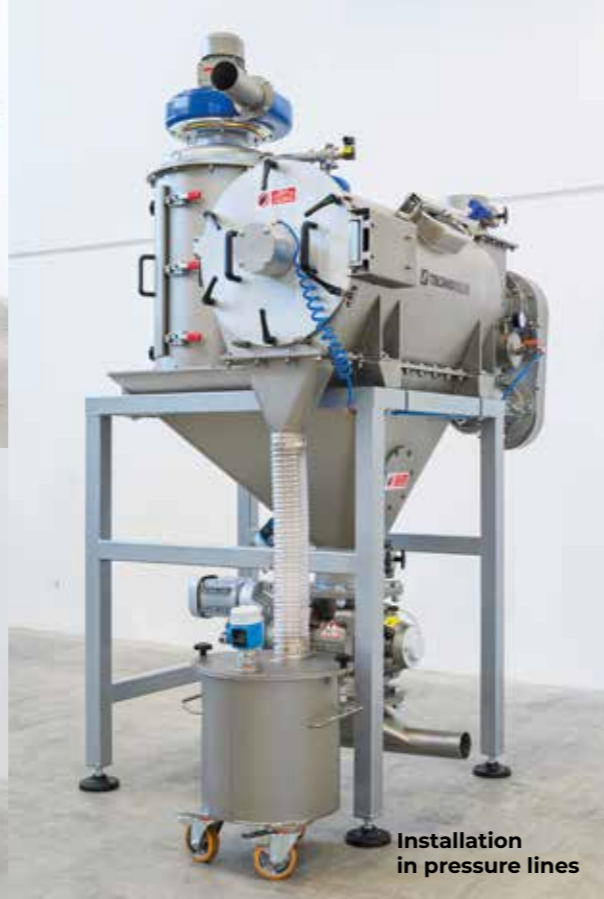
Installation in pressure lines