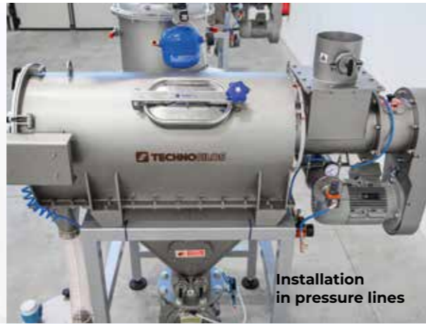
Installation in pressure lines