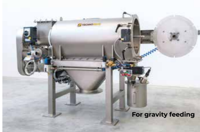
For gravity feeding