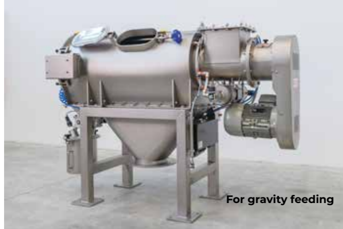
For gravity feeding