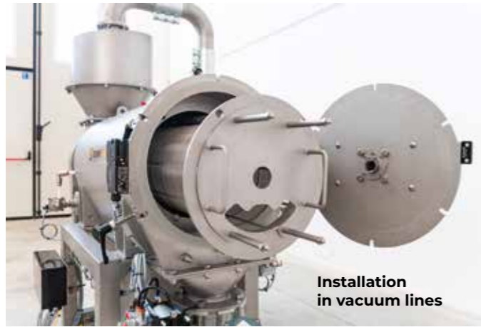
Installation in vacuum lines