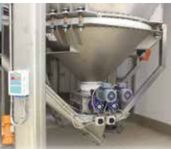
Silo weighing systems and loading safety system