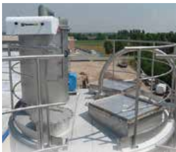
Loading air filtering and ATEX protections