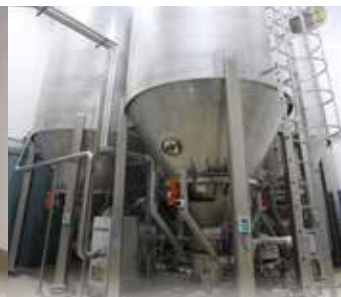
Drying system and double wall insulation