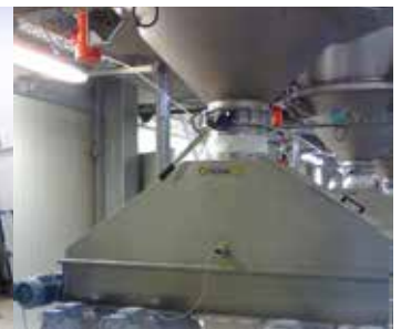
Single or multiple FIFO extraction